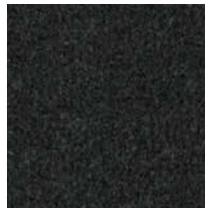
4230 | New York black