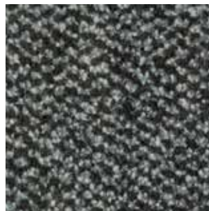
4201 | Singapore grey