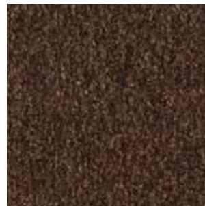
4226 | Tangier brown