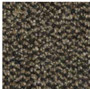
4204 | Santos brown