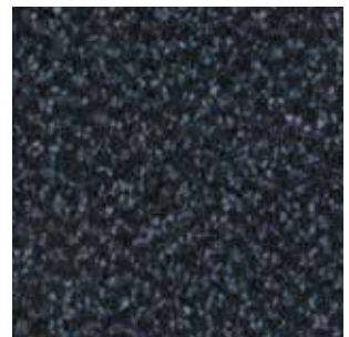
4207 | Panama blue