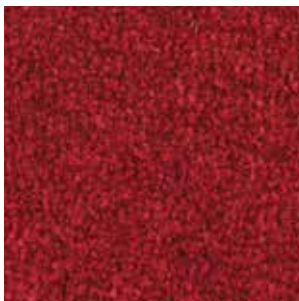
4223 | Hong Kong red