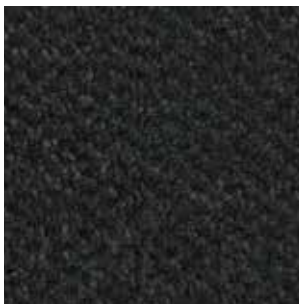
4210 | Rotterdam black